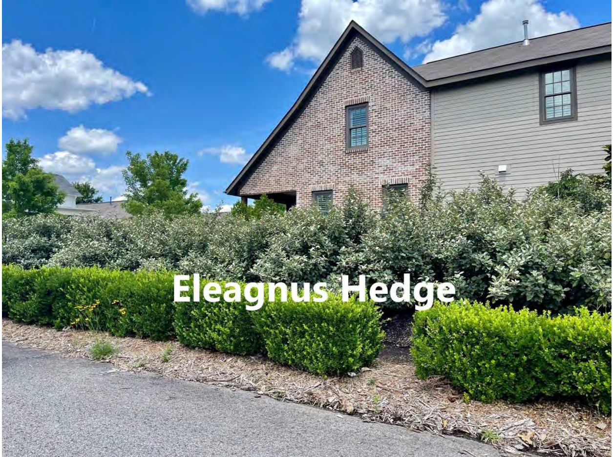
Hedge view from parking lot toward Chris' house – we will install same kind of hedge on North buffer.