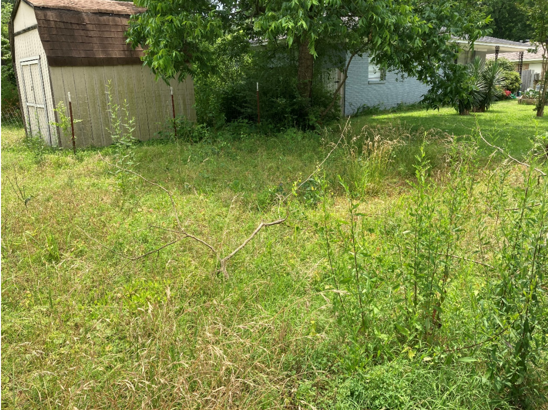
BEFORE PICS 1365 MITCHELL ST