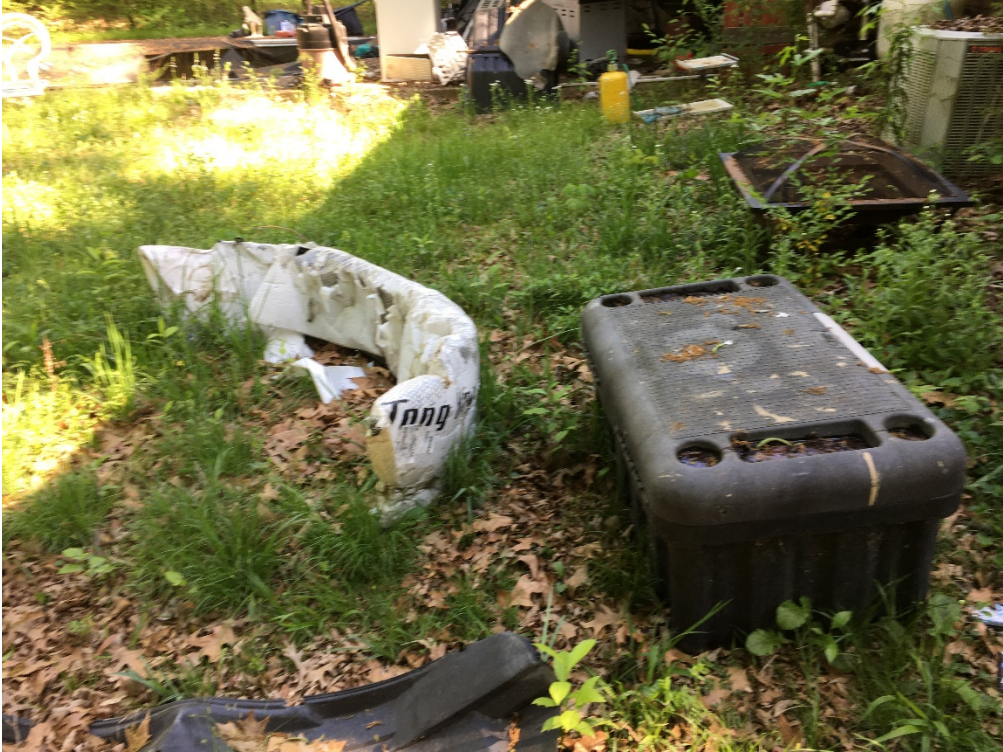
Before Pics 1499 Manor