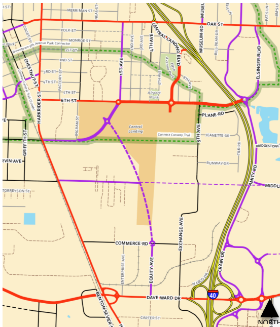
Master Street Plan Adopted June 26, 2018