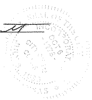
Mayor Bart Castleberry