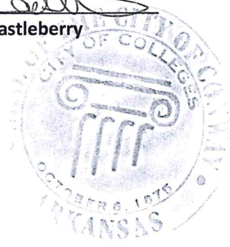
Mayor Bart Castleberry