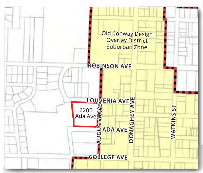
Requested Zoning Variance. Reduce the front setback along Augusta Ave. from 25' to 15'.

Overlay. None (Across street from Old Conway Design Overlay District).